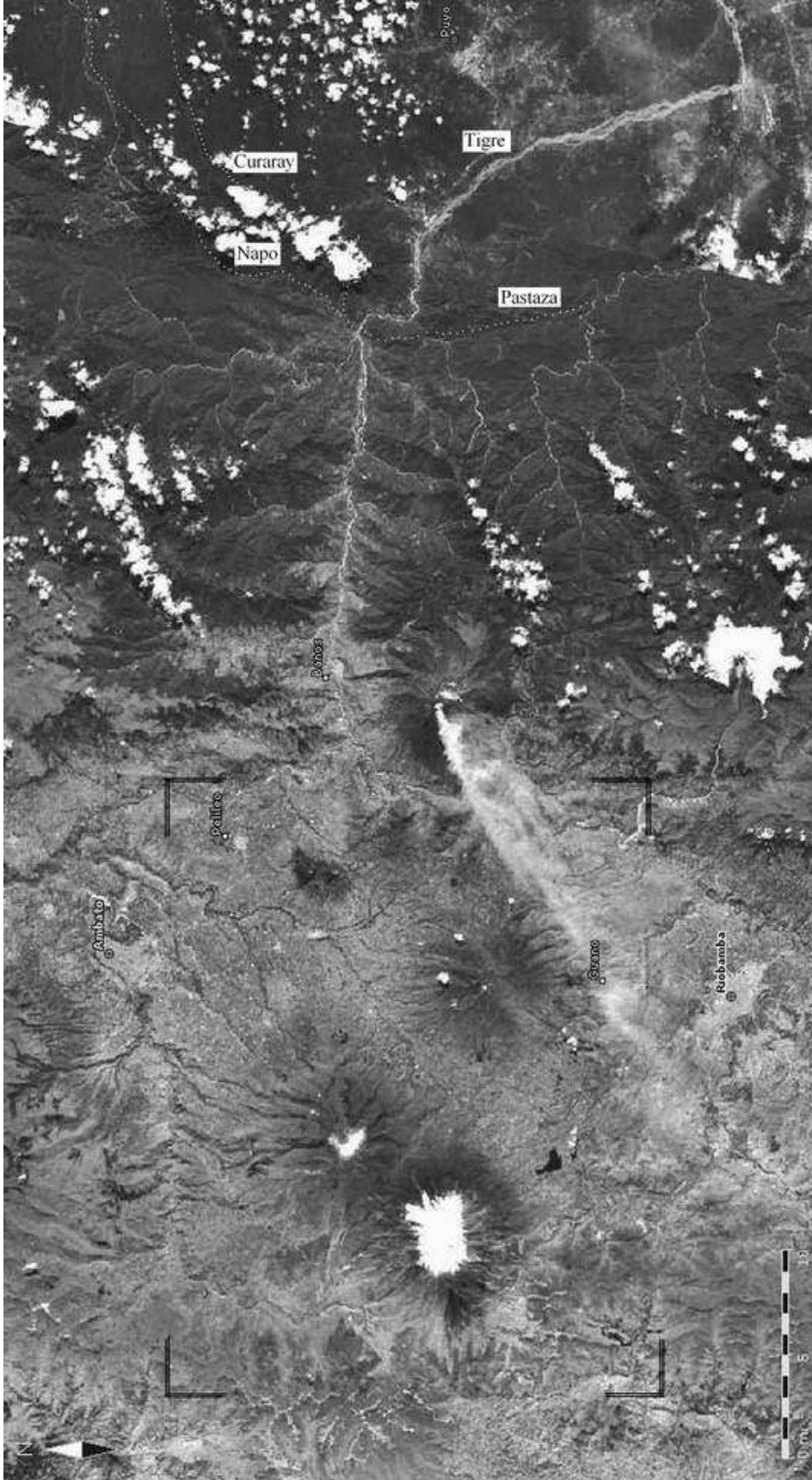
A satellite image in Ecuador, between Ambato and Riobamba. Within the four corners, identify natural contours of a rectangular area about 30 miles by 20 miles. The ancient river paths are defined by parallels that reach existing primary rivers.